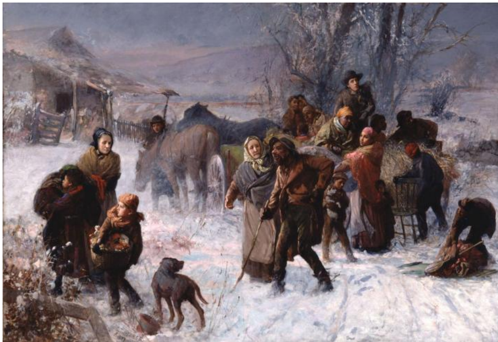
Cincinnati, Ohio, 1840s

Hint: In this 1893 painting, slaves are arriving in the “free” state of Ohio.