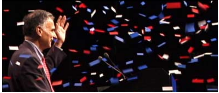
Ralph Nader at Madison Square Garden.

In addition to the measures listed here, the work of Public Citizen's scores of researchers prompted the creation of the U.S. Environmental Protection Agency and the Consumer Product Safety Commission.