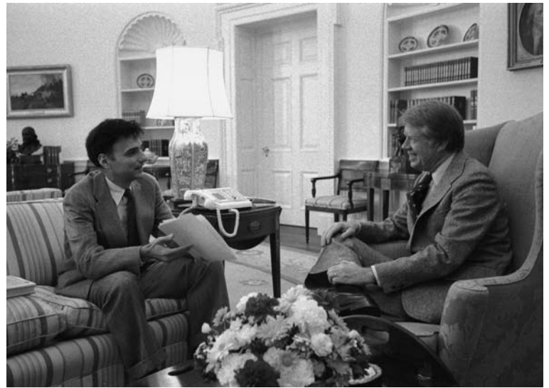
Ralph Nader and Jimmy Carter.