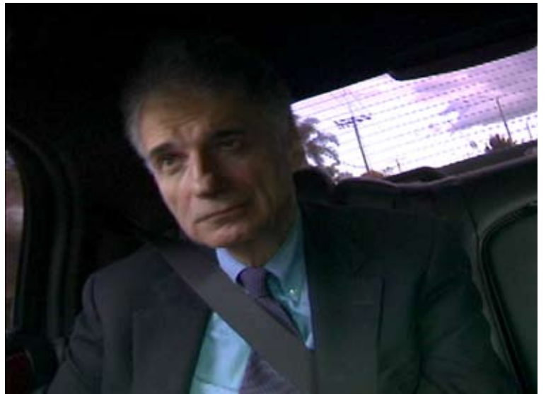
Ralph Nader.