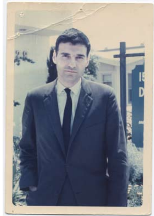
Ralph Nader.

Democratic stalwarts. Nader continues to be one of the most trusted figures in America because of his crusades on behalf of consumer rights. Only time will tell if his foray into presidential politics has harmed his legacy.