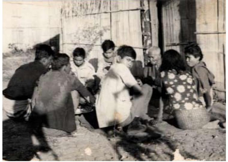
Many Uch in a Cambodian Refugee Camp

As part of efforts to tighten security in response to September 11, the U.S. government pressured Cambodia to change its policy. In March of 2002, the Cambodian government agreed to accept Cambodian refugees who were being forcibly deported. The agreement limits the number of deportees accepted each year, however, creating the delays experienced by people in the film. Currently, approximately 1,500 Cambodian Americans await deportation.